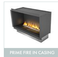
PRIME FIRE IN CASING