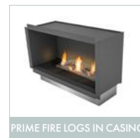
PRIME FIRE LOGS IN CASING