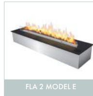
FLA 2 MODEL E