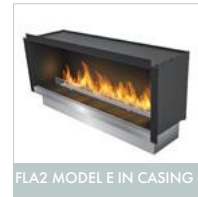
FLA2 MODEL E IN CASING E